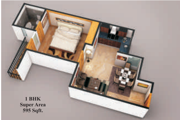
1 BHK Super Area 595 Sqft.