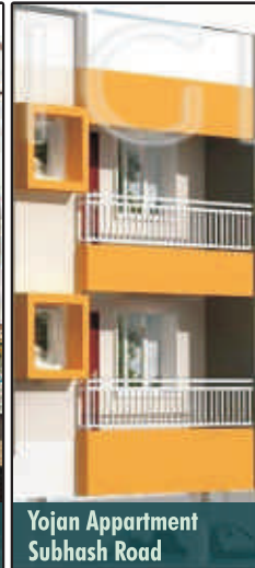
Yojan Apartment Subhash Road