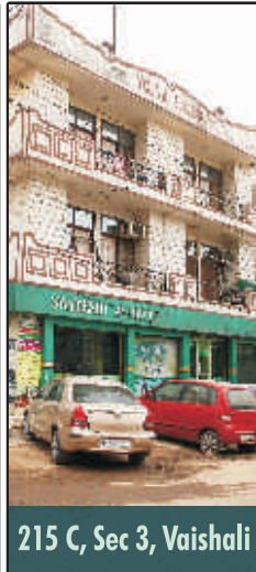
215 C, Sec 3, Vaishali