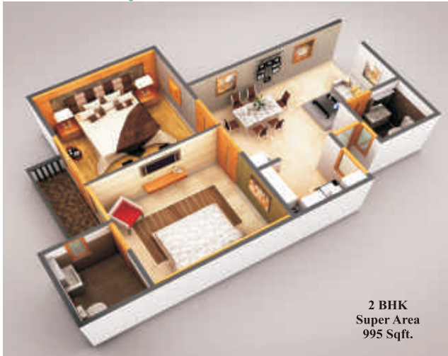
2 BHK Super Area 995 Sqft.