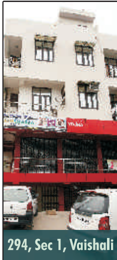
294, Sec 1, Vaishali