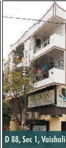
D 88, Sec 1, Vaishali